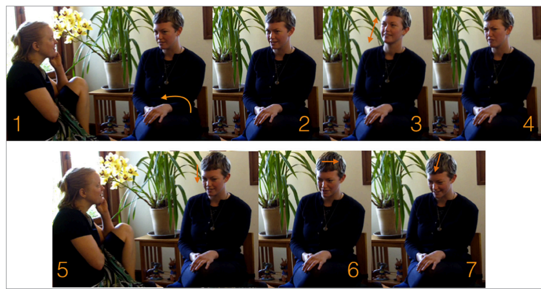
Figure 3: Stills from Airports .