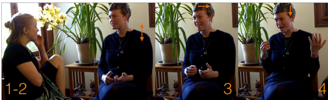
Figure 1: Stills from Airports .

Another strategy is exemplified in Figure 2 and Transcript 2, from the end of the first quoted dialogue. Here, we observe character facial expressions for each quoted utterance,