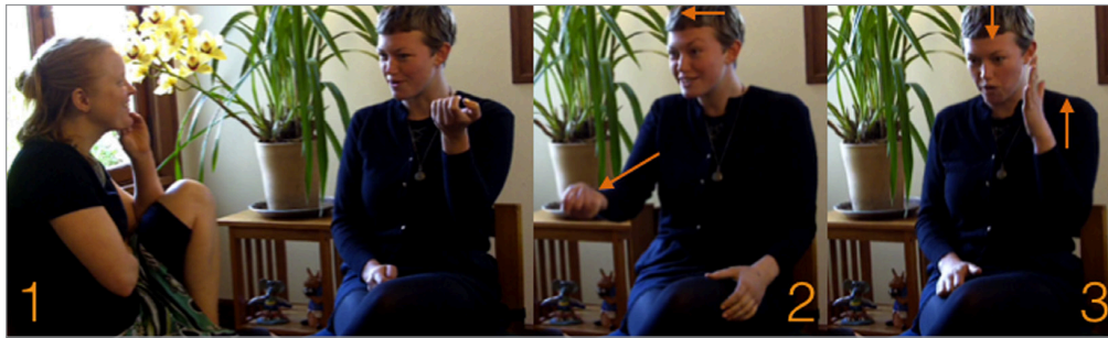
Figure 2: Stills from Airports .

1 Black: [A] they were like why do you have an Irish passport [3] 2 [past.self] I was like I have this one too [5] 3 [A] and they were like god why did you show us the Irish one [5]