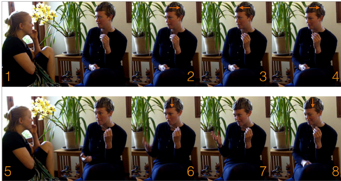
Figure 4: Stills from Airports .